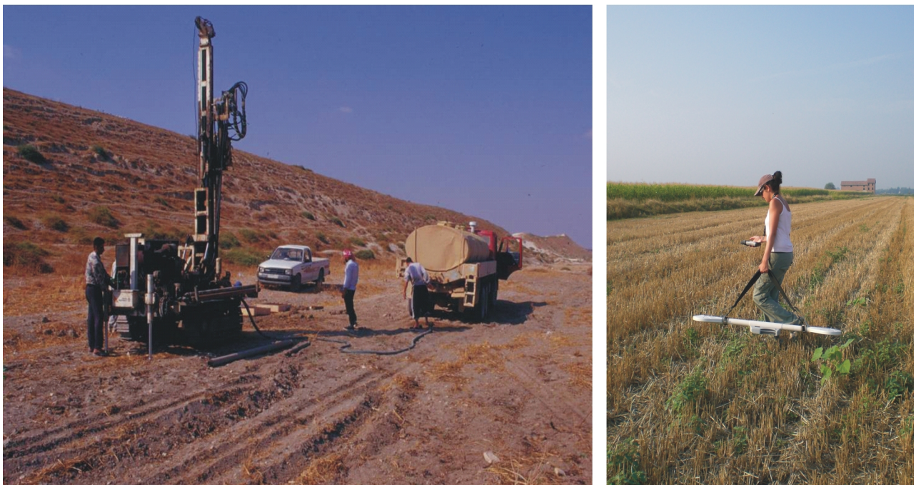
Fig. 2, Geoarchaeologists at work: coring the Bronze age site of Qatna in Central Syria (left) and performing a geophysical survey (right) in the central Po Plain (Terramara S. Rosa, RE).

I suoli sepolti, e i siti archeologici ad essi associati, conservano evidenze dell'impatto umano sul territorio. È il caso, ad esempio, dei suoli sepolti nelle alluvioni della pianura padana centrale (Rubiera, RE).