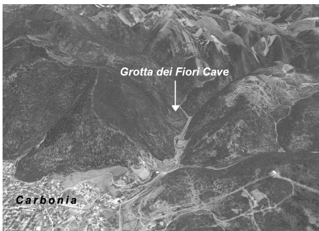
Fig. 1, Location of Grotta dei Fiori. Ubicazione di Grotta dei Fiori.

Grotta dei Fiori Cave (Carbonia, Sardinia) is one of the many caves in South western Sardinia that contains fossiliferous deposits with large and small mammals intercalated with flowstones. The cave is localized nearby the Carbonia town and developed in a Cambrian limestone ("Gruppo di Gonnese") slightly metamorphosed by Ercinic tectonic (Fig.1). The hypogean karstification started at Lower Cambrian and continued at different times until the Quaternary. The cave evolution was made through various spelaogenetic cycles