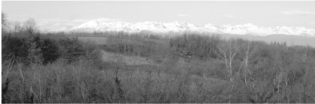
Fig. 2, The described scarp evidence Evidenza della scarpata descritta

the entrenchment of the ancient rivers in the east sector, the dissection of the east sector and the genesis of numerous landslides.