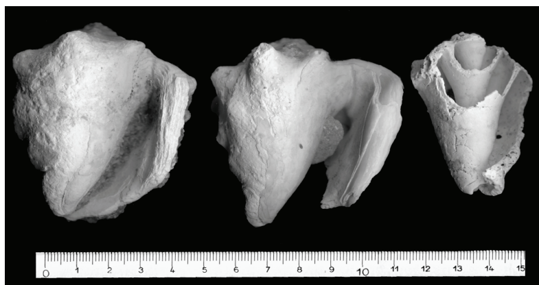
Fig. 1 – Fig.1 – Strombus bubonius shell from deposits draged at – 8,5 m (unit 3 of Fig.2), few hundred meters far from the La Plaia coast line along the entrance channel to the Industrial harbour of Cagliari Strombus bubonius provenienti dal livello dragato a – 8,5 m (unità 3 in Fig.2) in corrispondenza del canale di accesso al nuovo porto container, alcune centinaia di metri al largo del cordone litorale di La Plaia.

We describe some new sections of the same level, highlighted on a recent excavation performed at - 15 m. On the port access channel, the underwater survey has allowed more detailed facies and