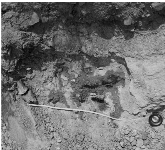
Fig. 9 - A detail of the outcrop of Fig. 8 with fossil hippo remains. Un dettaglio dell'affioramento illustrato in Fig. 8 con i resti fossili di ippopotamo.

tion lasted three weeks, two of which were spent on the Katharo plateau. During this field work, some remains of the endemic ?Middle Pleistocene hippo of Crete, Hippopotamus creutzburgi Boekschoten & Sondaar, were recovered (Figs. 8, 9); they were described ten years later