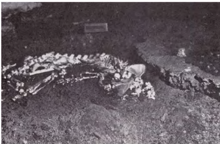
Fig. 4 - September 1966: the skeleton of Sardolutra ichnusae (Malatesta) inside the Grotta di Nettuno tunnel (Sardinia).