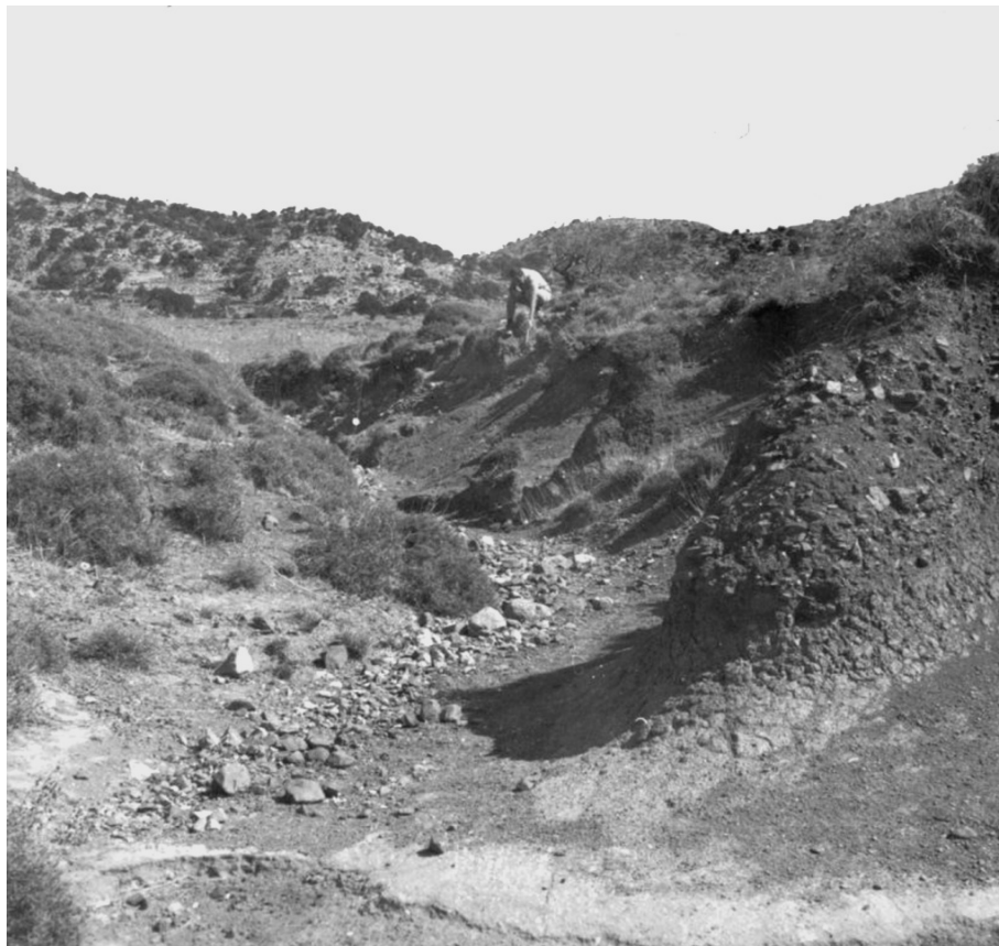
Fig. 8 - September 1972: Katharo plateau. Dried streamlet showing lacustrine clayey marls overlain by debris flow. V. Pettinella indicates the outcrop with bones.

Settembre 1972: Altipiano di Katharo (Creta). Letto asciutto di un torrente in cui affiorano le marne argillose sovrastate da depositi di debris flow. V. Pettinella indica il punto dell'affioramento fossilifero.