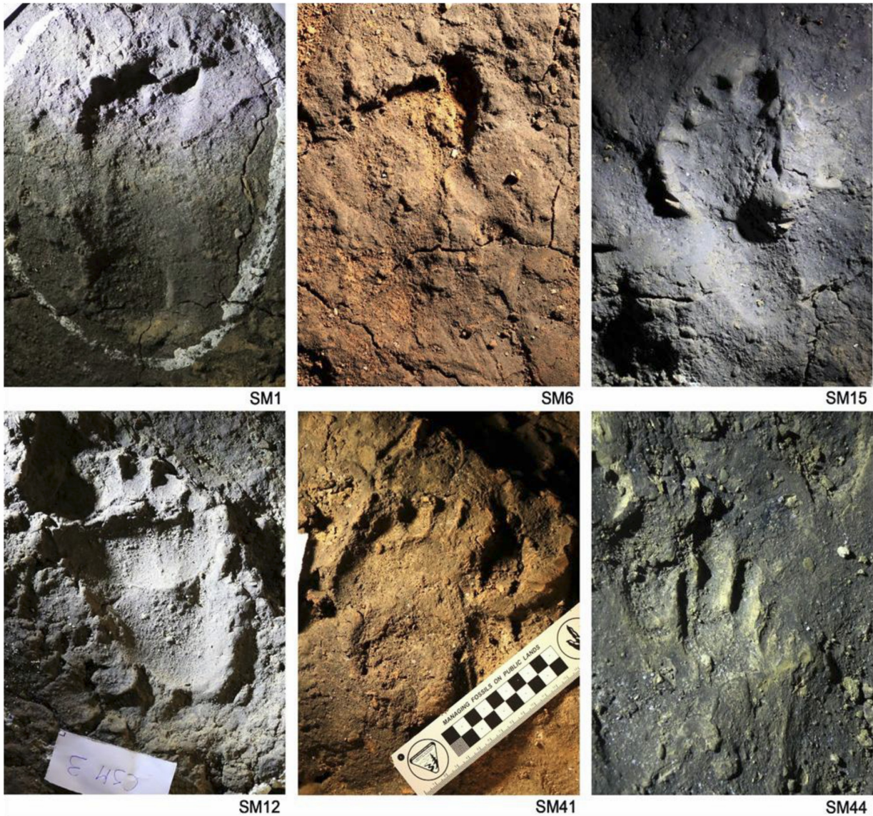
Fig. 1 - Human footprints, bear footprints and human traces preserved in the 'Sala dei Misteri' in the Grotta della Basura SM1, SM6, SM15 human footprints; SM12 adult bear footprint; SM41 immature bear footprint; SM44 human finger traces.

double-checked, using photos and photogrammetric models. The measurements of human footprints are based on both the landmark proposed by Robbins (1985), and on studies following the forensics medicine methods. For all the studied footprints, a photogrammetric model was obtained using photos taken with a 24 Megapixel Canon EOS 750D (18 mm focal length). The software used to build the models in this paper is Agisoft PhotoScan Pro, ( www.agisoft.com ), among the most user-friendly programs for photogrammetry' (Mallison and Wings, 2014). The accuracy of the obtained models is up to 1 mm for close-range photography (Fig. 2).